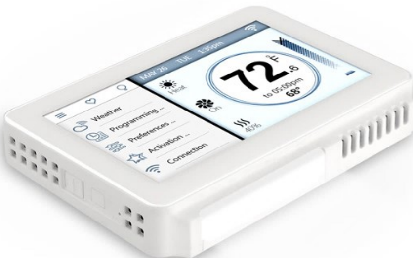
Vine Cloud Service Portal and its Apps