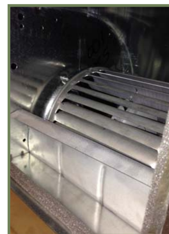
FORWARD CURVED BLOWERS OPERATE AT LOW RPM FOR LOW NOISE