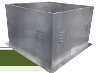
RCGV ROOF CURB