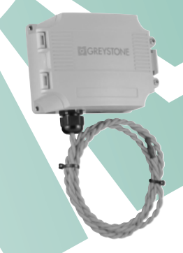
WD-100-XX - Water Detector c/w Conductivity Cable