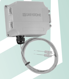
WD-102 - Water Detector c/w Remote Sensor