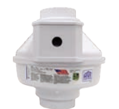
CSF4 79415 & 79415A

To exhaust air in a crawlspace, choose this solution: