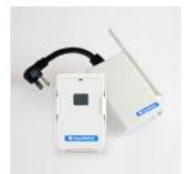
AMK-WB Wireless Button and Receiver