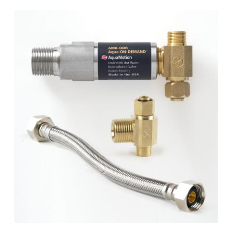
Components for Under Sink Installation