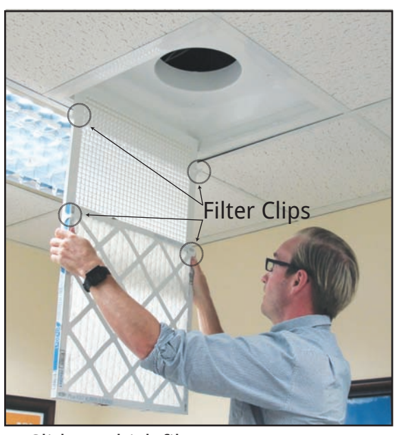
Slide 1" thick filter onto eggcrate face, sliding through filter clips...