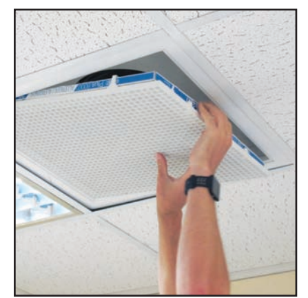
Lift face up and close. Secure by turning the two plastic screw heads with a coin or screw driver.

For best results use an Industry Standard 20" x 20" x 1" filter, measuring 19.5" x 19.5" x 7/8" or less