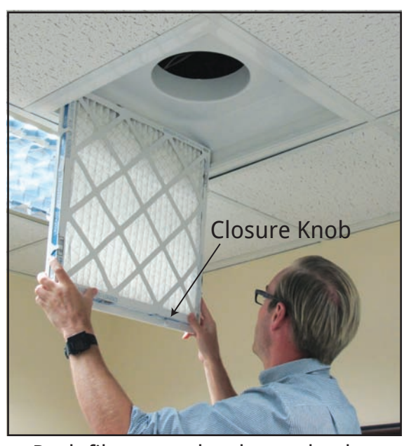
Push filter past the closure knobs.