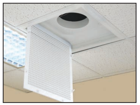
Eggcrate face will hang down on hinges. You can lift off and remove face for cleaning. If inserting or replacing filter leave hanging.