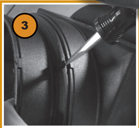
Twist screwdriver to innitiate separation of unneeded collar section(s).