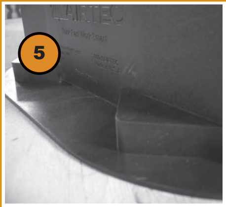
If furring or strapping for drywall is in use, position MH against framing member with pictured stand-offs contacting underside of framing member.