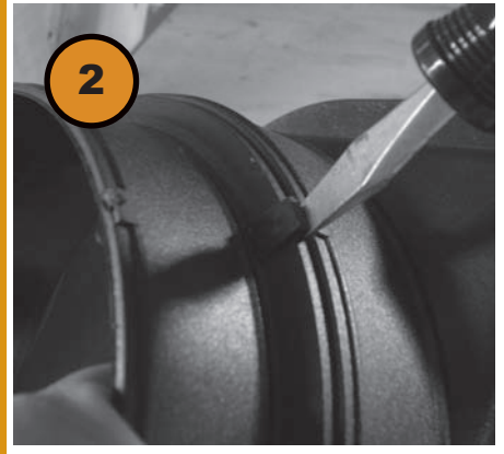
Place flat screwdriver head into the appropriote slot to remove unneeded collar(s).

Locate collar removal slots. If using smallest collar size, collar removal is unneccessary, skip to step 5.