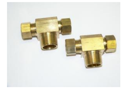
(Custom brass 1/2" compression x 3/4" MIP x 1/2" compression Pre-Fab T's)

The System adapts to your existing plumbing! Follow these simple steps: