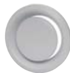
BOC/BOR Interior Air Valve