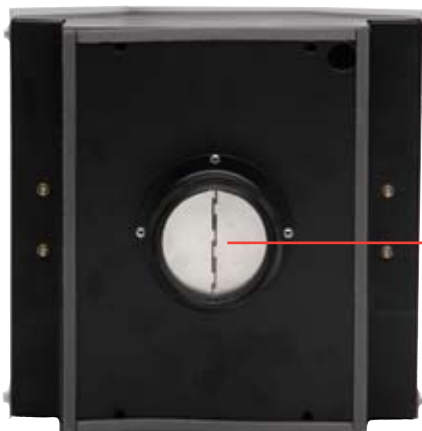
Built-in Spring-loaded Backdraft Damper

The larger grill allows for the easy exhaust of "dirty" or lint laden air while the spring-loaded backdraft damper helps prevent insects, etc. from entering duct work.