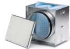
MFL Filter Box