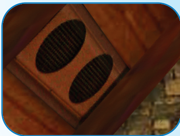
Inside view, available in white or brown.

TC1000-H Ventilator The TC1000H is the only ventilating fan designed and assembled in the USA for use in a solid roof or wall application. Perfect for A-Frame construction or for homes that don't have an attic. Two energy efficient fans move 800 cubic feet of air per minute. A motorized insulated damper seals when the fan is not in use preventing cold air, insects, and the elements from entering your home. The TC1000H is one speed, comes equipped with a wall switch, is maintenance free, carries a three year warranty and is Underwriters Laboratory approved.