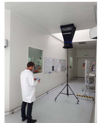
Use with the telescopic tripod