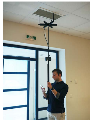
Use with the measurement grid