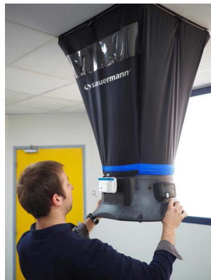
Use of the air flow meter