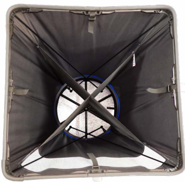
Hood with flow straightener