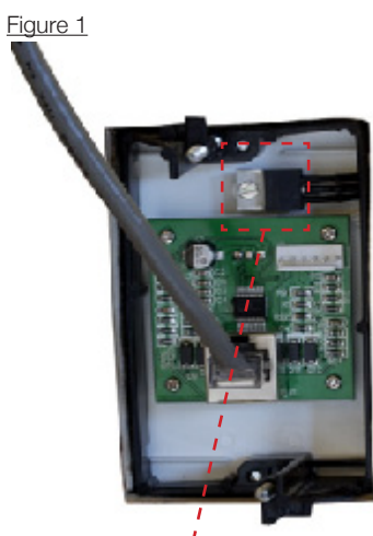
The indoor temperature sensor is located inside of TSP wall switch

To ensure the temperature sensor's accuracy, we strongly recommend installing the TSP wall switch only on an insulated interior wall. At minimum, position the switch away from any sources of heat such as exterior walls or direct sunlight.